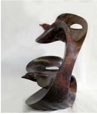
STONE CARVE "BIRDS IN FLIGHT" with BETTY SAGER